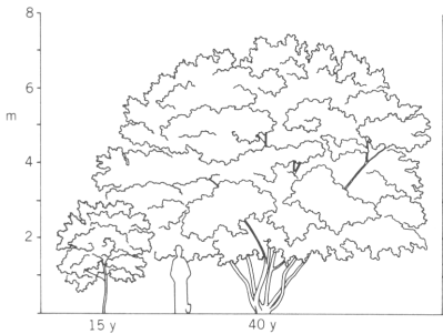
tatarian maple Acer tataricum

Native to eastern Europe and western Asia, tatarian maple has potential as an unique tree in our landscape. It ranges from 15 to 30 feet tall and wide. Most often this plant is a large multi-stem shrub, but can be trimmed into a small rounded to wide spreading tree. This tree transplants easily and tolerant of difficult conditions including drought once established. Southwest Missouri is considered in the southern portion of this plants effective range. Leaves are simple, opposite, 2 to 4 inches long, usually unlobed, but vigorous growth may develop 3 to 5 lobes and look similar to amur maple (some consider amur maple a subspecies of tatarian maple), the petiole is 3/4 to 2 inches long. Flowers are borne in clusters in April to May, greenish-white and not very showy. These develop into samara 3/4 to 1 inch long in July—August, wings almost parallel in various shades of red turning to brown before falling off. The cultivar ‘Rubrum’ is reported to have blood red fall color. Specie fall color is yellow to red to reddish brown. Considered an invasive in some parts of the US.