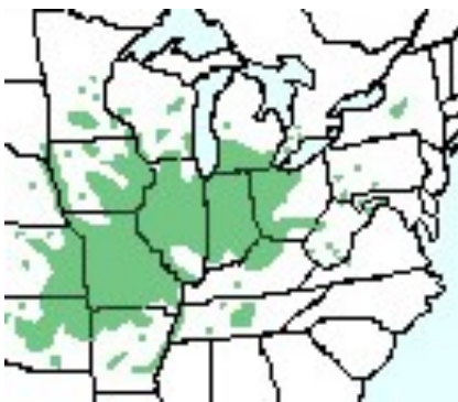
Map: Virginia Tech Dept. of Forest Resources and Environmental Conservation

Kentucky coffeetree is a large, deciduous tree with a mature height of 60 to 75 feet and width of 40 to 50 feet. Under utilized in urban areas, Kentucky coffeetree is excellent for parks, yards, and larger parkways. The male cultivars should be planted over the female due to the large seed pod of the plant. The branches are stout with large pinnate leaves and small leaflets making this tree perfect for planting on a south exposure providing shade in the summer while allowing sun through in the winter. Native to Missouri, Kentucky coffeetrees' ranges from Minnesota to Oklahoma to Tennessee to Pennsylvania and New York.