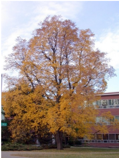
Kentucky coffeetree Gymnocladus dioica