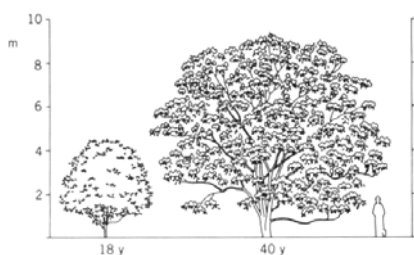
Japanese tree lilac Syringa reticulata

The Workshop is free, open to everyone, and has 2 ISA CEU's available for it. No registration is needed, just show up.