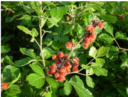
Fragrant sumac Rhus aromatica

The workshop recordings are divided into 8 parts. The videos are available for free to watch by anyone on the University of Nebraska - Lincoln Extension's MediaHub site for the Nebraska Forest Service. As of 1/28/2019, the videos are listed on two separate pages with the titles starting with "Tree Risk Assessment" and "Tree Risk Management". View them all at: https://mediahub.unl.edu/channels/18735 .