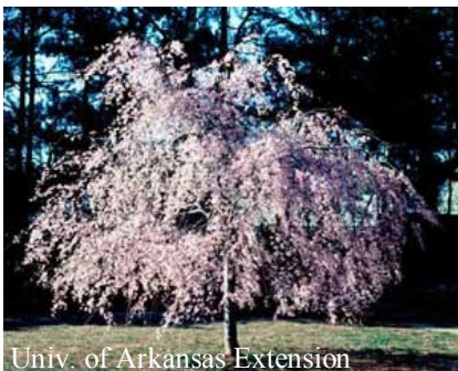
Univ. of Arkansas Extension

I and many of you have been blessed to have a career we enjoy that provides for our families, unfortunately many do not. These people have my and should have your respect for enduring a job they do not enjoy or are underemployed in to work for their family. They have identified the most important thing on this planet and work for it.