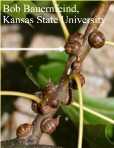
Bob Bauernfeind, Kansas State University

Pin Oak Kermes scale may be found on multiple oak species, but favor their namesake pin oak. The scale inserts its stylet into the phloem of the host tree to suck sap. In natural ecosystems, natural enemies, weather, and other environmental factors control the insect. In urban settings, infestations can become a problem. The adult female lays eggs in late August to September. Crawlers hatch in late September to October and move to cervices in the bark to overwinter. In spring, female crawlers move to new growth to become established for feeding and mating. Damage can include twig dieback. Chemical control appears to be best with sprays during the crawler stage or with systemic chemicals.