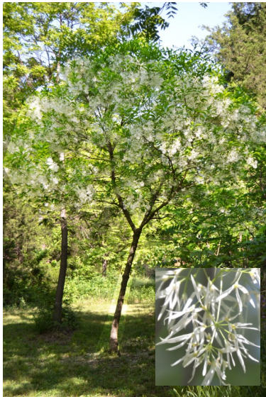
white fringetree Chionanthus virginicus

A small tree to large shrub, white fringetree is well suited to southwest Missouri. Ranging from 12 feet to 30 feet tall and often wider than tall. White flower panicles are showy, more so on male plants. Leaves are single and lance shaped. Fall color ranges from yellow to brown. Grows well in full sun to light shade. Prefers deep, moist, fertile, acid soils, but adapts well to urban sites. Cultivars of note include: 'Emerald Knight' for upright habit and long dark green glossy leaves; 'Spring Fleecing' for shiny, narrow leaf, heavily flowered male clone. Emerald ash borer has been reported to attack this plant by researchers in Ohio.