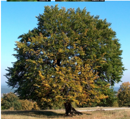
European Hornbeam Carpinus betulus

European hornbeam is a medium sized tree reaching 40 to 60 feet in height and 30 to 40 feet in width. With a slow to moderate growth rate, fertilizer and steady, adequate water can increase the rate. Specie growth habit is pyramidal to rounded in youth to oval-rounded to rounded with age, but many cultivars have been developed for columnar, globe, and weeping shapes. Tolerant of a wide variety of soil conditions, but grows best in well drain sites. Prefers full sun sites, but will tolerate light to moderate shade. These characteristics make this tree usable in a variety of situations. There are very few insect or disease issues with this plant. None are noted as important or affect appearance. Known for the columnar cultivars, many others are available for globe, flat topped and weeping shapes, deeply lobed leaves, purple growth of newly formed leaves, and variegated leaves.