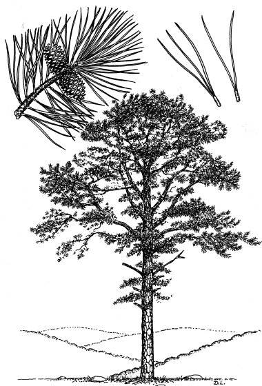
Shortleaf pine Pinus echinata

The only pine native to Missouri, shortleaf pine is a large tree with a mature height of 60 to 100 feet, long trunk and broad open crown. Appropriate for a large yard, and park plantings this tree has a medium to fast growth rate. Occurs naturally on dry upland with acid soils, but can grow in a wide range of conditions. It needs full sun to help maintain full needle cover. Needles are in fascicles of two and three, dark bluish-green, and three to five inches long.