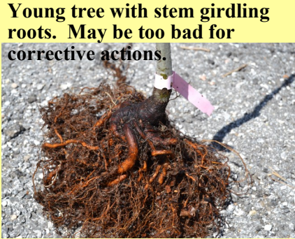
Young tree with stem girdling roots. May be too bad for corrective actions.