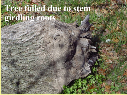
Tree failed due to stem girdling roots

Stem girdling roots are a common issue with planted trees. It rarely, if ever, happens in nature. Stem girdling roots are roots that grow up against the trunk of the tree. It often is an issue that does not show its effect until many years, often decades, after planting. Just about the time the tree is large enough to provide the desired benefits, the tree declines and dies. Stem girdling roots occur due to improper planting practices and modern growing practices at nurseries. Nurseries can reduce girdling roots through the techniques of planting the tree at proper depth in the nursery bed or container. Also, new containers that allow for air root pruning reduce girdling roots in that system. Final transplanting requires tree to be planted at the proper depth of the root flare at or slightly above the surrounding soil level and may require cutting roots that are growing in circles and/or back towards the trunk. See more info at: https://conservancy.umn.edu/handle/11299/49810