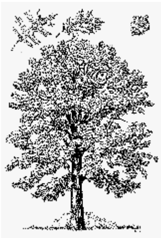
black oak Quercus velutina

Black oak is a medium, deciduous tree with a mature height of 50 to 60 feet and variable spread. Excellent for wildlife, it is also useful for landscaping. Appropriate for medium yards, the specie does best on moist soils. Several minor pests may affect this specie, though most do not cause problems until the specie hits "old age" of 100 to 150 years. At this point several insect and fungal specie attack the tree as it declines. This is a good alternative to northern red oak in appearance.